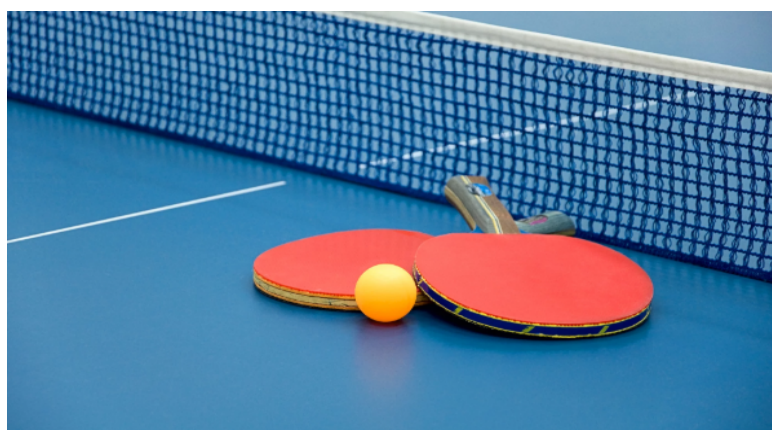
Table tennis has been a huge success this term with increased numbers of students coming along to training sessions looking to develop their skills.

If you want to try a new sport, come and give netball a go every Tuesday after school.