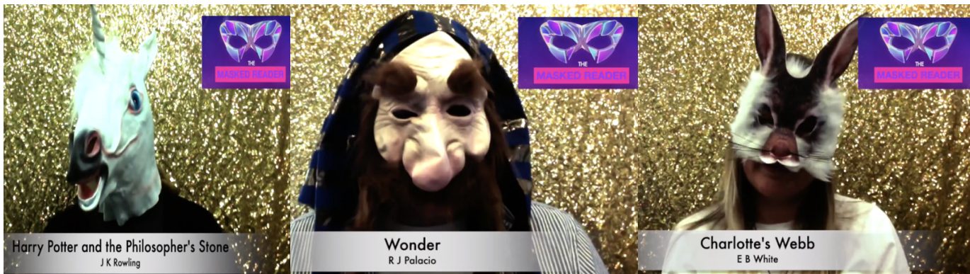
Harry Potter and the Philosopher's Stone J K Rowling